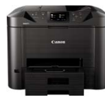
MAXIFY MB5450 series